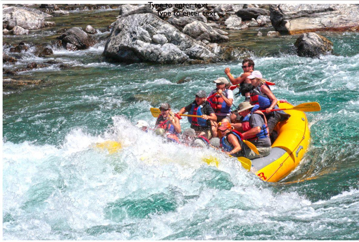
Flat Iron River Fun